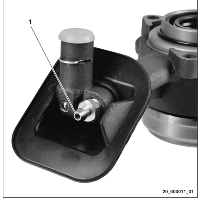
Fig. 1: Example of version A

Bleeding the hydraulic system: Open bleed nipple.