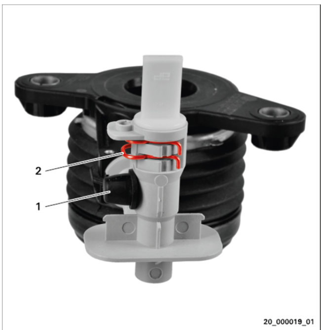
Fig. 3: Example of version B