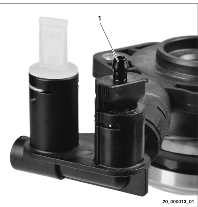
Fig. 2: Example of version A