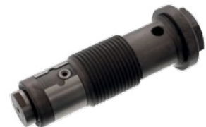
febi no. 40152

Register now for the official febi bilstein newsletter and receive the latest technical information automatically by email! Further information may be obtained at: www.febi.com