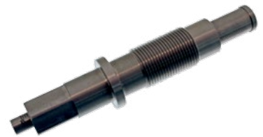
Measuring chain tensioner febi no. 40125

Fits: Mercedes-Benz models with M271 engine (EVO) and inverted tooth chain Repl. no. 271 589 07 63 00