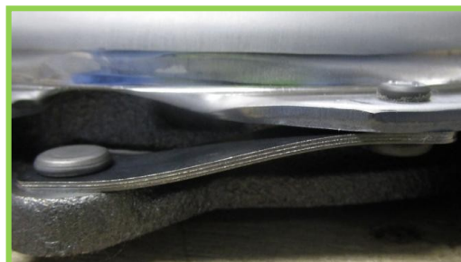
Fitted part returned as warranty; shows deformation/damage to the drive strap