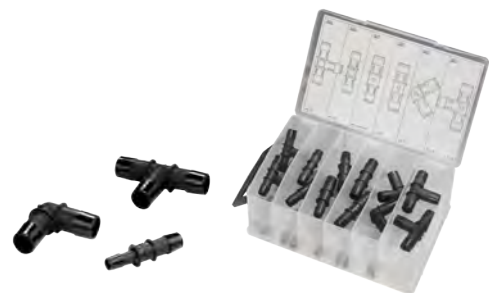
Heater hose connectors: available separate or in a kit