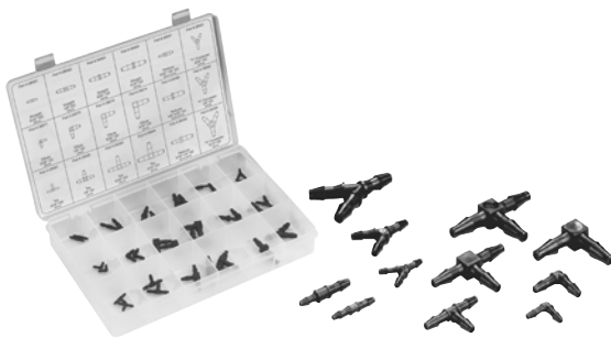
Connectors for fuel line, windshield washer hose and vacuum tubing: available separate or in a kit

In addition to a large range of hoses, Gates offers all necessary connectors. Using straight, elbow, reducer, "T" and "Y" shapes, almost any hose configuration can be constructed.