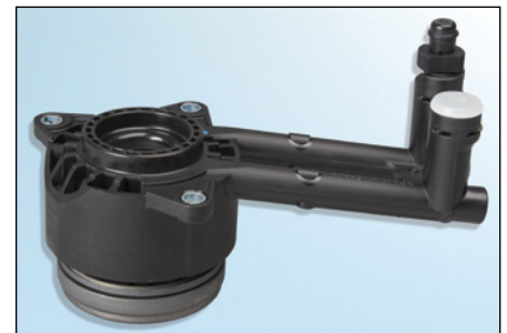
Figure 4: New plastic design

As part of our efforts to continuously develop our products, the housing of the concentric slave cylinder with the item number 510 0011 10 has been changed from metal to plastic.