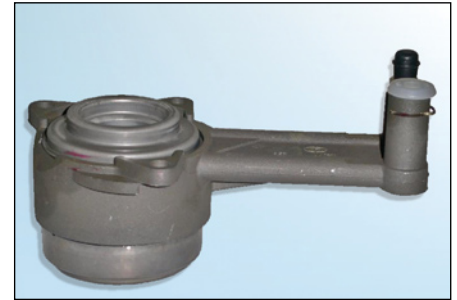
Figure 2: Old metal design