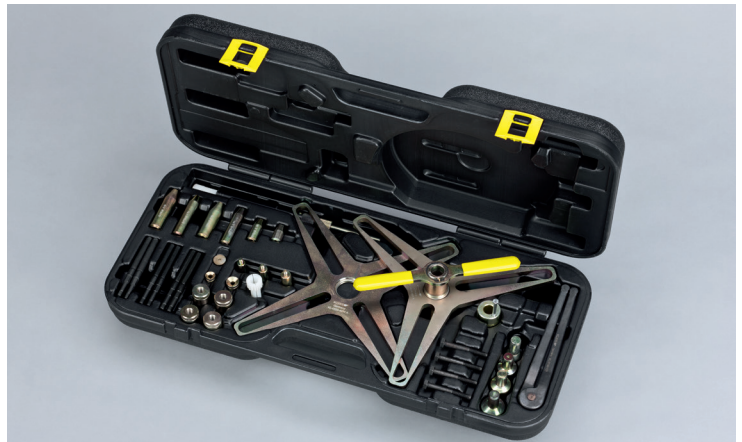
Fig. 2: Special tool 400 0237 10 enables professional clutch repair

Please observe the vehicle manufacturer specifications!