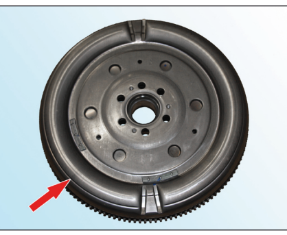
Fig 3: LuK-DMF

The LuK-DMF is identified with a dent (Fig. 3, Arrow) in the primary flywheel.