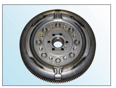
Fig 4: Sachs-DMF

The primary flywheel of the Sachs-DMF is formed without a dent.