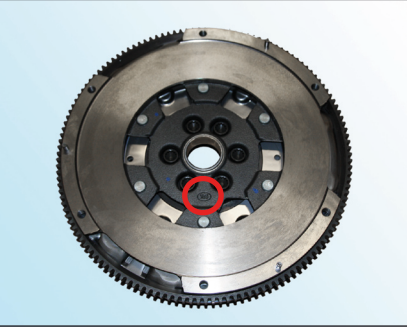
Fig 1: LuK-DMF