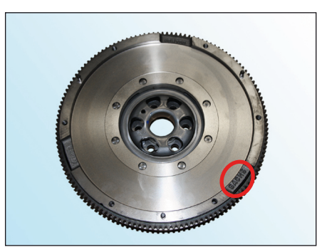
Fig 2: Sachs-DMF

The LuK-DMF is identified with a dent (Fig. 3, Arrow) in the primary flywheel.