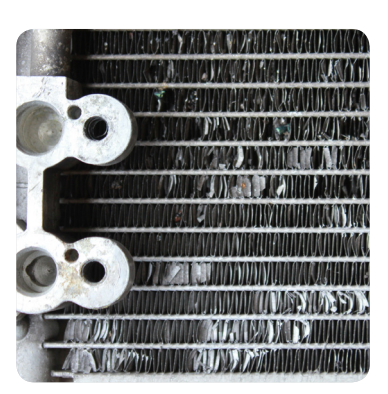
Visibly deteriorated condenser fins

Leaking condenser – Testing has shown that a condenser with missing fins, due to corrosion caused by saltwater, will eventually start to leak. The leakage is caused as the lack of fins destabilizes the condenser construction, making it more vulnerable to wear and tear. As the refrigerant disappears, the system will not function properly. Furthermore, as the lubricant cannot be distributed in an empty running system, the compressor will be exposed to overheat and seizure.