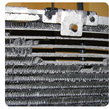
Several rows of missing fins caused by condenser corrosion