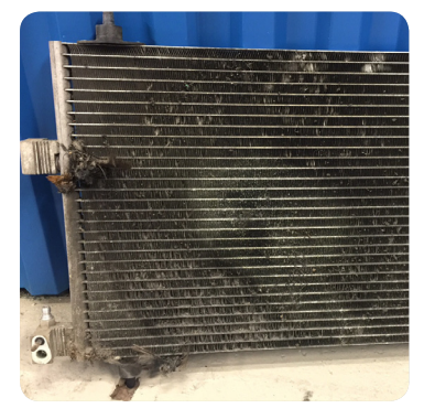
Seems tight, however, a condenser in such a condition cannot perform well and must definitely be replaced

©Nissens A/S, Ormhøjgårdvej 9, 8700 Horsens, Denmark. For further technical and contact information visit our website www.nissens.com.