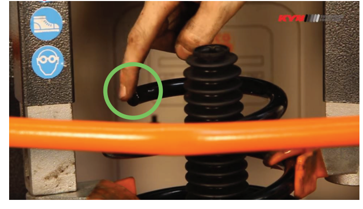
Check overall alignment of assembled unit