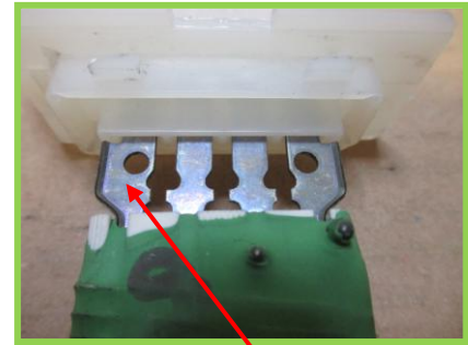
Blueing on the resistors pins

When the part has been visually inspected there is evidence of blueing (thermal damage) on the pins of the electrical connector. This indicates that the resistor has been subjected to over current.