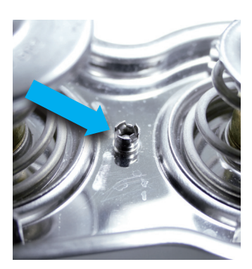
Figures 1 and 2: Ball valve (arrow) on the thermostat disk in different thermostat types

But the reason is simple: depending on the vehicle and type of thermostat, a ventilation valve is be fitted to the thermostat disk (see Figures 1 and 2) to allow any entrapped air to escape after assembly (see Figure 4).