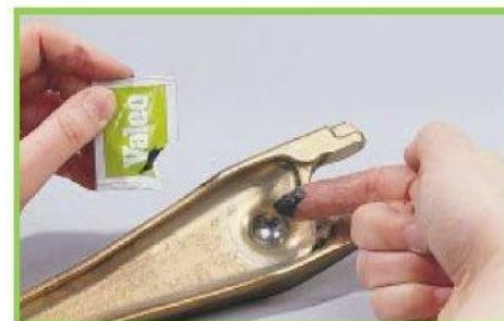
Use the grease applied in the kit sparingly

The Valeo Service warranty department receive a number of returned clutches with issues of juddering or slipping of the clutch. After inspecting the returned parts, there is clear evidence of incorrect, too much or incorrectly applied grease which has radiated from the drive plate hub from centrifugal force and coated the friction surface. Once the grease has come into contact with the friction surface, the coefficient of friction of the drive plate is reduced so it can no longer transmit all of the engine torque resulting in the effect of juddering or slipping. Always check the condition of the gearbox and the engine to prevent oil and other contaminants leaking into the gearbox.