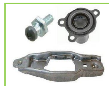
*Figure 3, clutch ball pin, guide tube and release arm