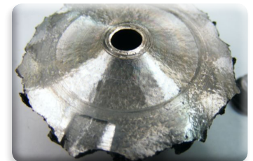
Orange Peel effect on backface