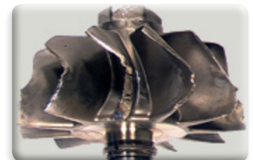
Turbine blade fracture