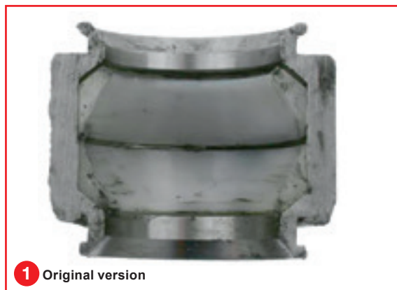
1 Original version

Further information may be obtained at: www.febi.com