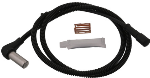
ABS - sensor with sleeve and grease febi no. 45825

to fit: Mercedes-Benz Truck Atego I - II Repl. no. 001 542 76 18