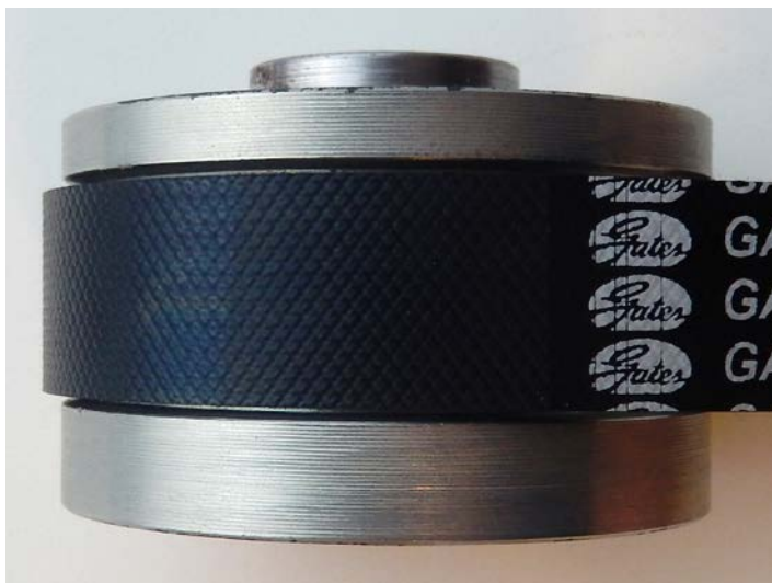
Fig.3 shows an OAP with 5 grooves that must be replaced by the 6-grooved OAP7144.